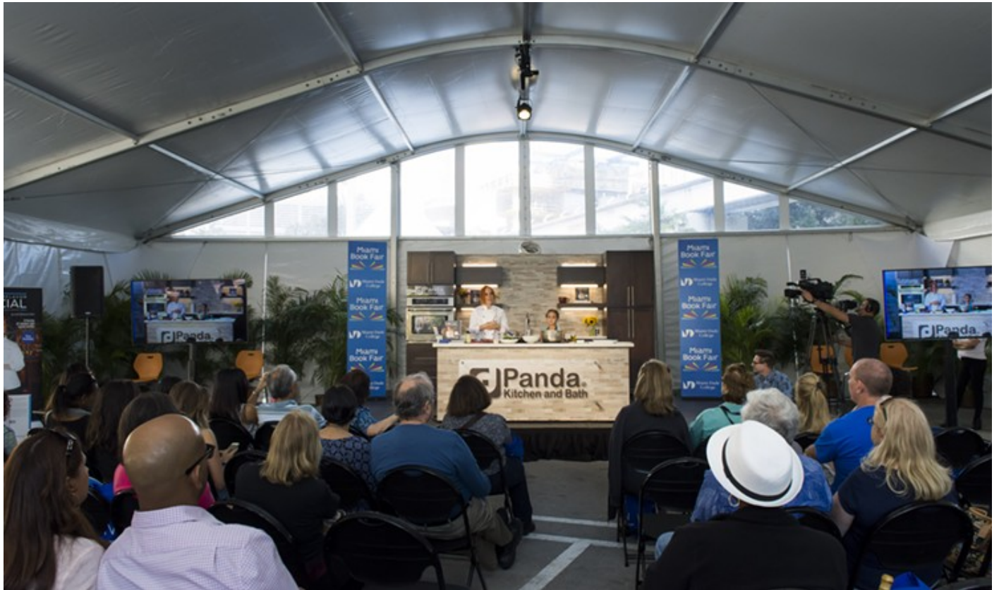
The Kitchen at Miami Book Fair.