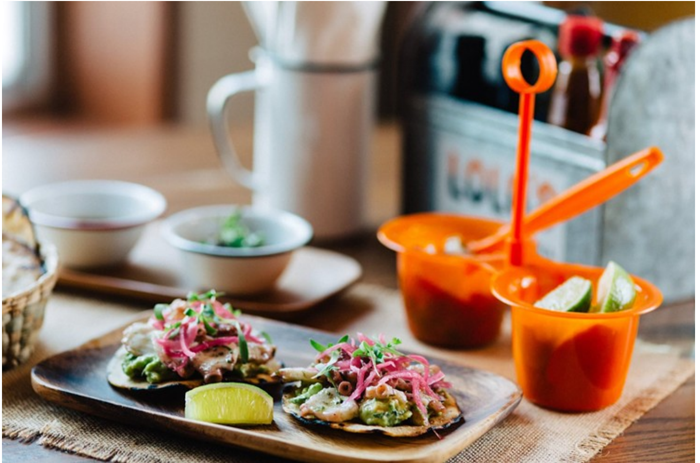
Opt for half-off tacos and $5 margaritas on Tuesday at Lolo Surf Cantina.