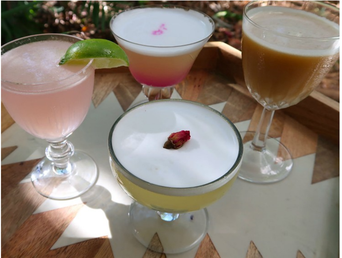
Daily/Nightly's daiquiri lineup.

and Lunazui tequila shots, which will be available all day from 11 a.m. to 1 a.m. Tuesdays beginning November 14 at Lolo's Surf Cantina, 161 Ocean Dr., Miami Beach; 305-735-6973; loloscantina.com .