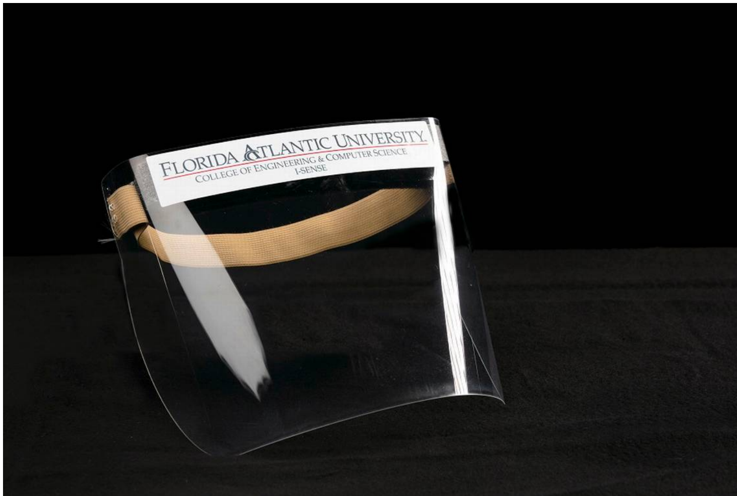
One of the 8,000 face shields Florida Atlantic University plans to assemble for Baptist Health South Florida, due to the lack of personal protective equipment during the COVID-19 pandemic.

The process requires workers to cut the plastic using a laser cutter. Then cut the foam and paste it to the plastic, and finish by attaching the elastic band.