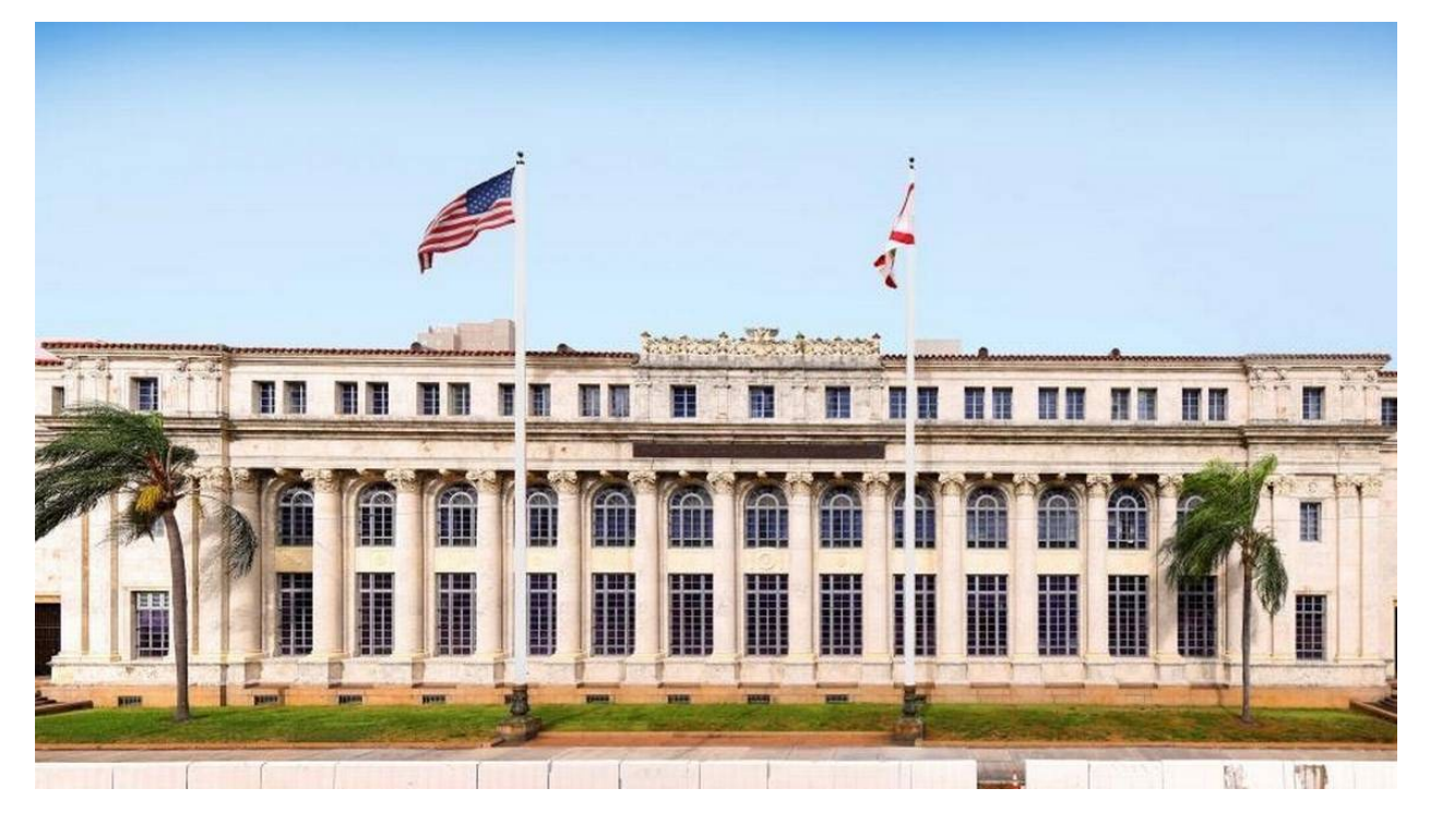
A panoramic view of the David Dyer Federal Building in Downtown Miami in 2016.

Three years after <u>taking possession</u> of Miami's grandly historic but long-vacant federal building, Miami Dade College is nearing completion on the initial phase of a massive $60 million renovation that will return the 1933 Neoclassical masterpiece to public use.