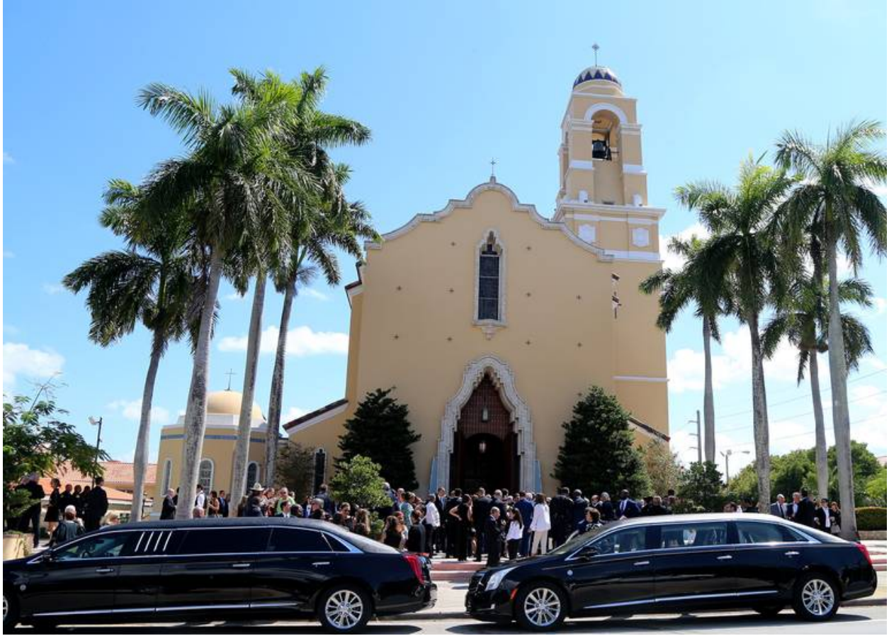
Family, friends and the community in general attended a funeral mass for former Miami Mayor Maurice A. Ferre, at The Cathedral of Saint Mary in Miami, on Thursday, September 26, 2019.