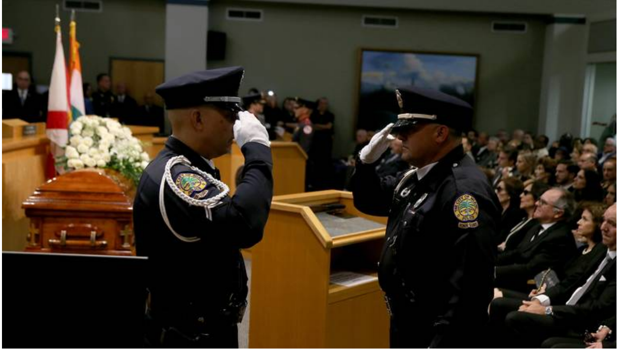
City of Miami Police officers guarded the casket of former Miami Mayor Maurice A. Ferre, during a memorial ceremony to honor his memory and legacy at city hall as Ferre became known as the “father of modern Miami” who shaped the city into the culturally diverse and vibrant community it is today. in Miami, on Thursday, September 26, 2019.