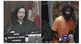
Man removed from Miami court after outburst WSVN 7NEWS Miami/Ft. Lauderdale