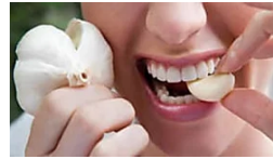
No More Tinnitus Ringing In Ears? ouremedy.com