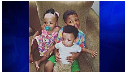
Mom arrested after 2 of her 3 children drown in locked SUV WSVN 7NEWS Miami/Ft. Lauderdale