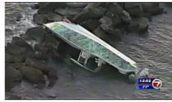
Woman's body found on shore confirmed as 4th passenger of fatal boat crash in Miami