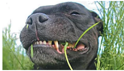
If Your Dog Eats Grass (Do This Every Day) Ultimate Pet Nutrition