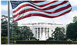
Born Before 1985? Gov't Will Pay $260/Month Off Your Mortgage (If You Qualify) LowRateShop