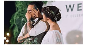
[Pics] After Bride Learns Groom Has Been Cheating, She Gets Back At Him At The Altar BrainSharper