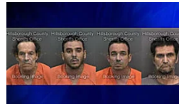
$500K truckload of stolen tequila recovered, 4 men arrested WSVN 7NEWS Miami/Ft. Lauderdale