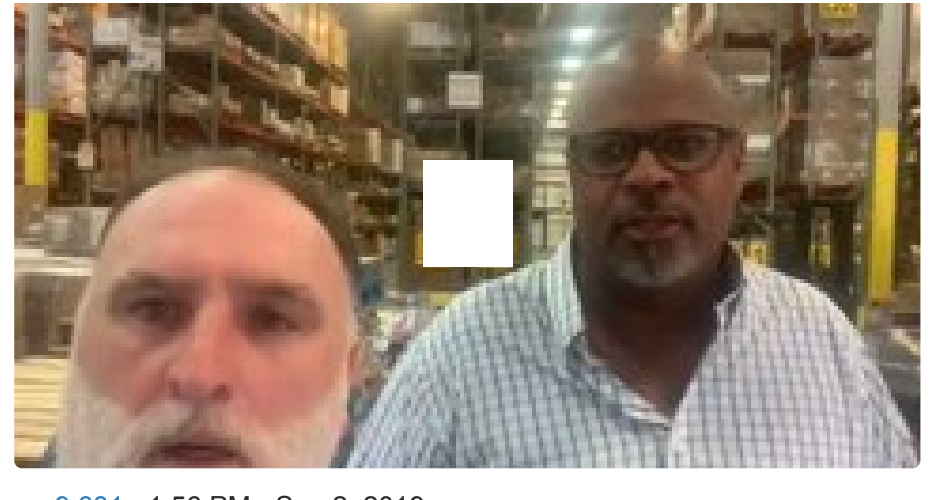
9,681 1:56 PM - Sep 2, 2019