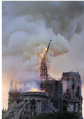
Flames and smoke rise as the spire on Notre Dame cathedral collapses in Paris, Monday, April 15, 2019.