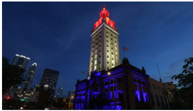
Freedom Tower to be illuminated Wednesday night in the colors of the French flag.