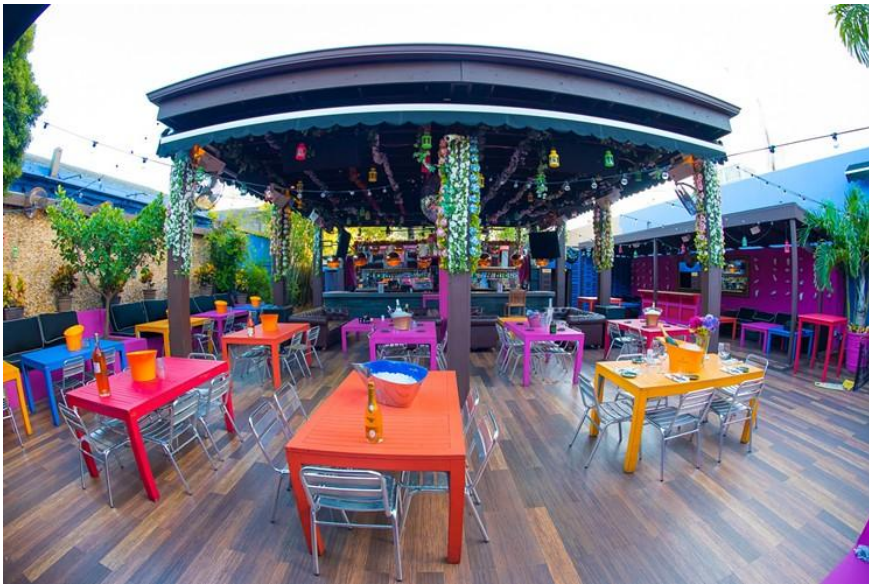
La Victoria Social Club

Some places are perfect for turning up the heat on the dance floor in Miami, and one of those spots is La Victoria. Get ready to sweat it all out as you groove to salsa, bachata, merengue, and more at this Design District hideout. Go solo and low-key or big and bougie with a table reservation or private event. La Victoria offers everything you could possibly want in terms of drinks, including bottles of champagne for a cool $1,400. But you won't need to break the bank for snacks such as empanadas de carne ($8) and yuca fries ($7) or full-on meals like tostones con carne ($14) and chicken caesar salad ($13). After you've done some damage, get back out on the dance floor and sweat off those tostones. Hours are 11 p.m. to 5 a.m. Thursday through Saturday.