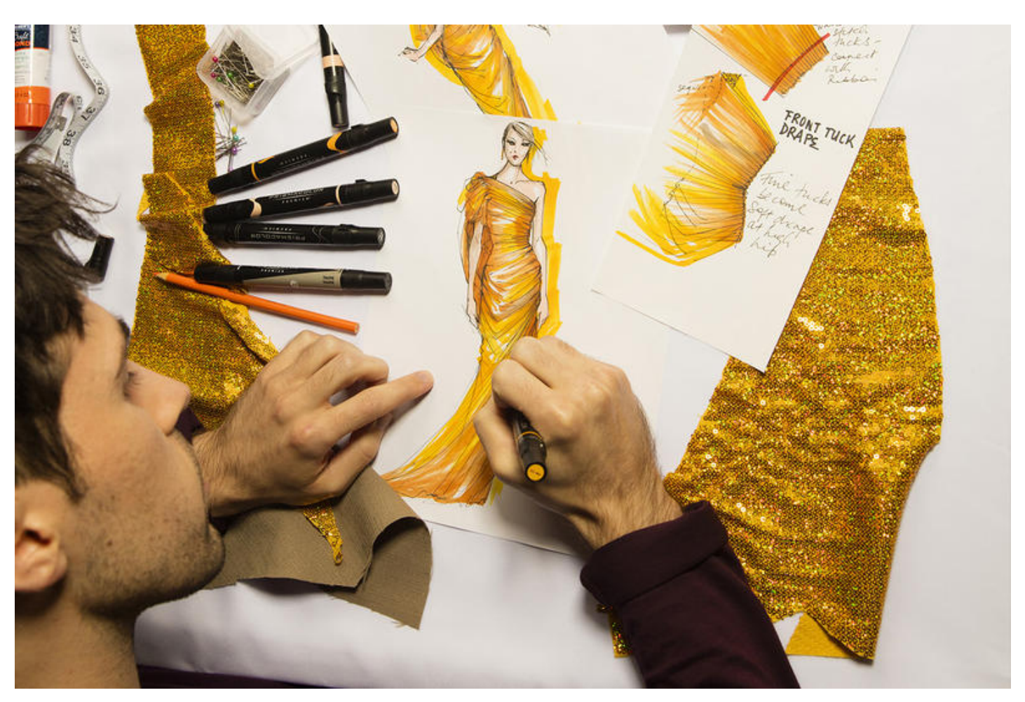
"The Fashion Lab" at the Miami Fashion Institute is where students gather to learn the necessary skills of the global fashion industry.

MIAMI FASHION INSTITUTE AT MIAMI DADE COLLEGE